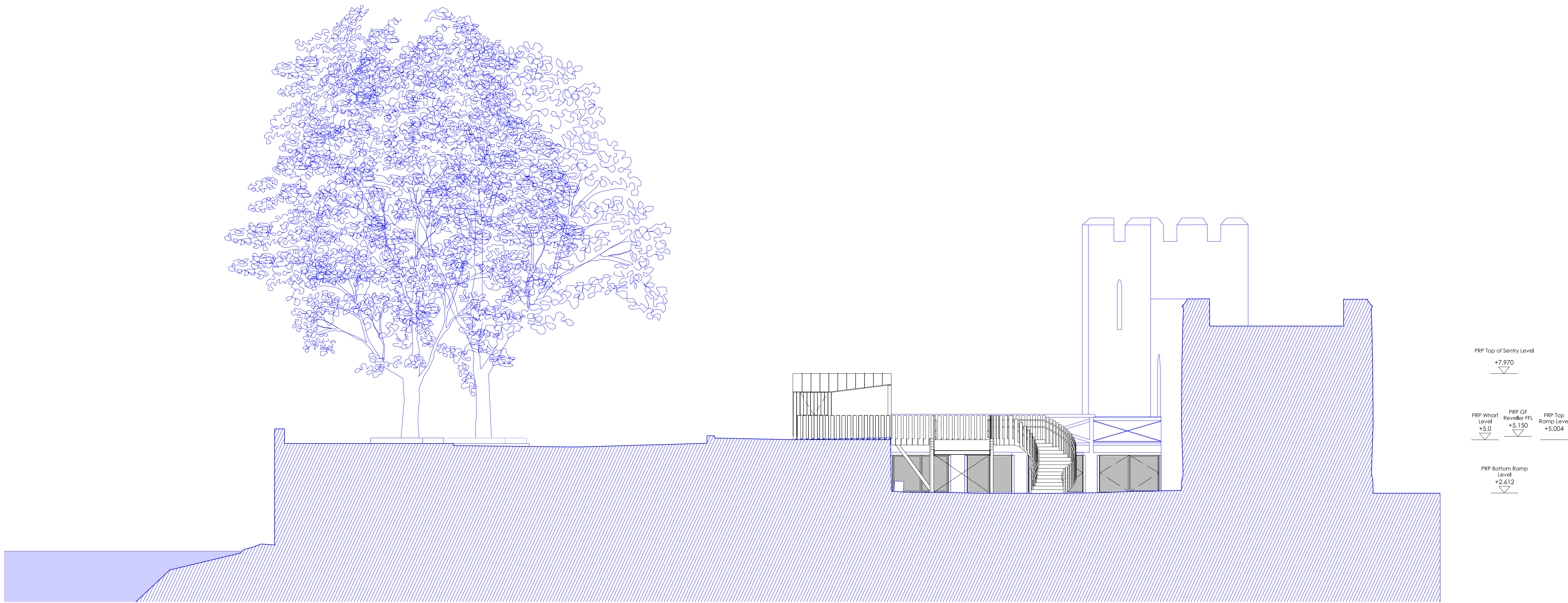
01 East Bridge Elevation 1133 Proposed